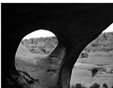
Cavern Arch, Lost Spring Canyon

The other side of this page contains a detailed map of the route from the highway to Lost Spring Canyon. Your odometer may vary slightly from these measured distances. This route begins as a very good, very straight dirt road, headed toward the La Sal Mountains.