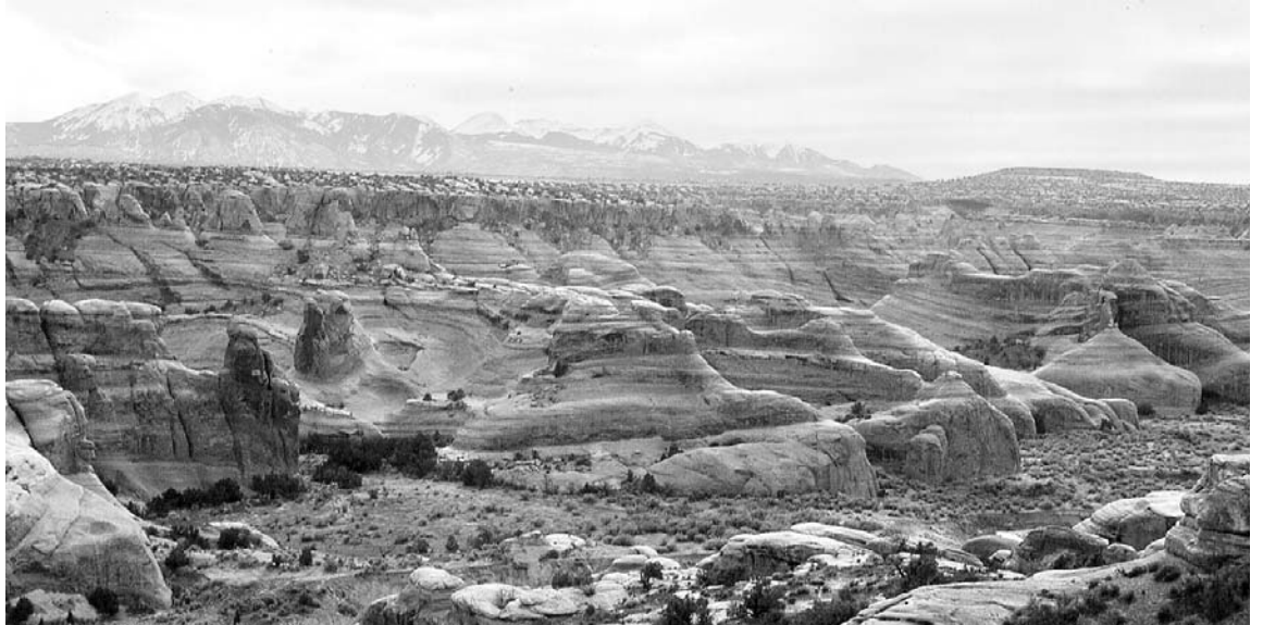
A view into Lost Spring Canyon

This 3,140-acre area was added to Arches National Park in 1998. It provides a unique backcountry experience. The Bureau of Land Management administered the area as a Wilderness Study Area since 1985, though Lost Spring Canyon has been grazed for years. When it was added to Arches, the Grand Canyon Trust generously purchased the grazing permit and donated it to the National Park Service. Livestock were removed and will be fenced out, enabling the National Park Service to begin vegetation monitoring, protection and restoration efforts. In addition, the removal of livestock has eliminated potential conflicts between recreational backcountry visitors and active livestock operations.