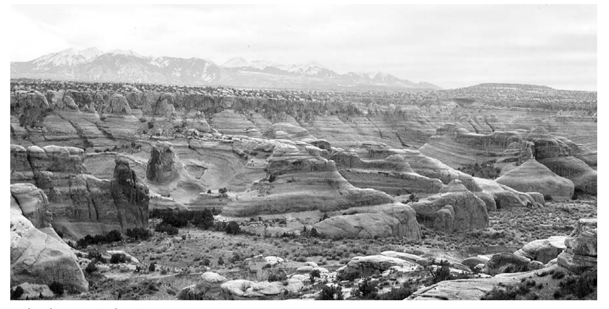
A view into Lost Spring Canyon

This 3,140-acre area was added to Arches National Park in 1998. It provides a unique backcountry experience. The Bureau of Land Management administered the area as a Wilderness Study Area since 1985, though Lost Spring Canyon has been grazed for years. When it was added to Arches, the Grand Canyon Trust generously purchased the grazing permit and donated it to the National Park Service. Livestock were removed and will be fenced out, enabling the National Park Service to begin vegetation monitoring, protection and restoration efforts. In addition, the removal of livestock has eliminated potential conflicts between recreational backcountry visitors and active livestock operations.