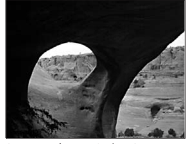
Cavern Arch, Lost Spring Canyon

The other side of this page contains a detailed map of the route from the highway to Lost Spring Canyon. Your odometer may vary slightly from these measured distances. This route begins as a very good, very straight dirt road, headed toward the La Sal Mountains.